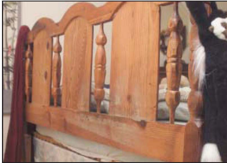
Mold growing on a wooden headboard in a room with high humidity.