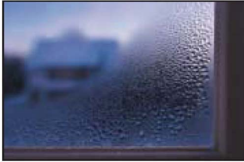
Condensation on the inside of a windowpane.

■ Keep indoor humidity low. If possible, keep indoor humidity below 60 percent (ideally between 30 and 50 percent) relative humidity. Relative humidity can be measured with a moisture or humidity meter, a small, inexpensive ($10-$50) instrument available at many hardware stores.